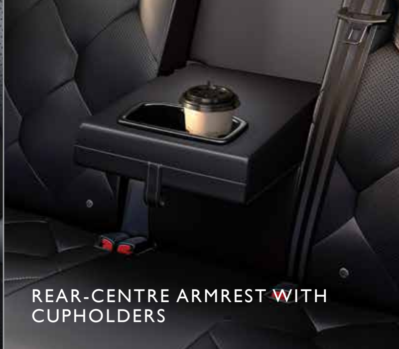
REAR-CENTRE ARMREST WITH CUPHOLDERS