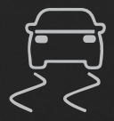
ELECTRONIC STABILITY PROGRAMME