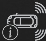
SMART DRIVE INFO