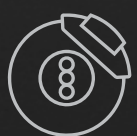
ALL 4 DISC BRAKES