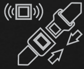
SEAT BELT REMINDER (ALL SEATS)