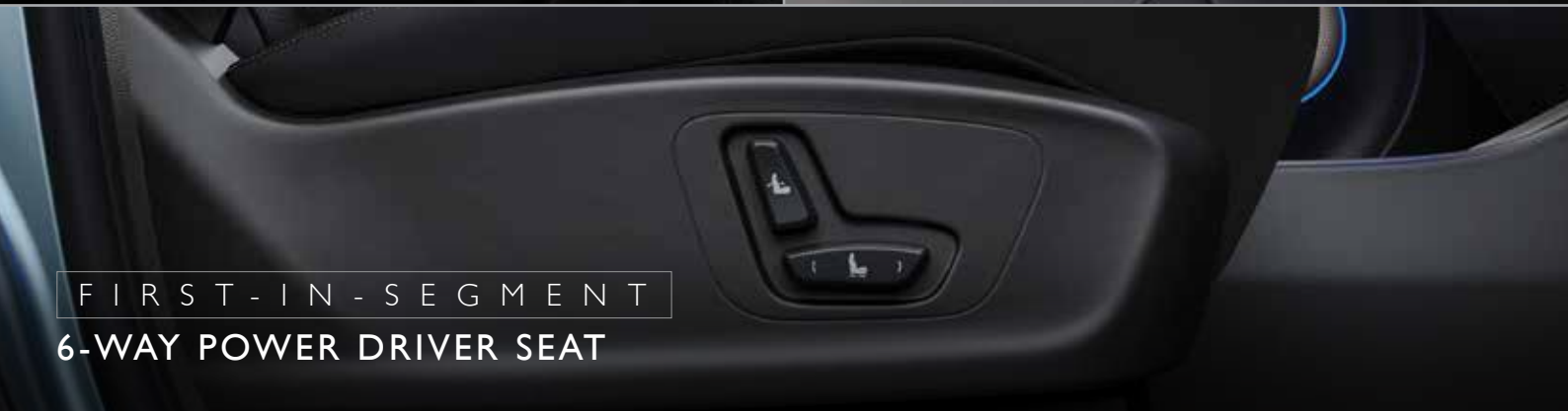
FIRST-IN-SEGMENT 6-WAY POWER DRIVER SEAT