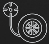
DIRECT - TYRE PRESSURE MONITORING SYSTEM