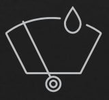
RAIN SENSING WIPERS