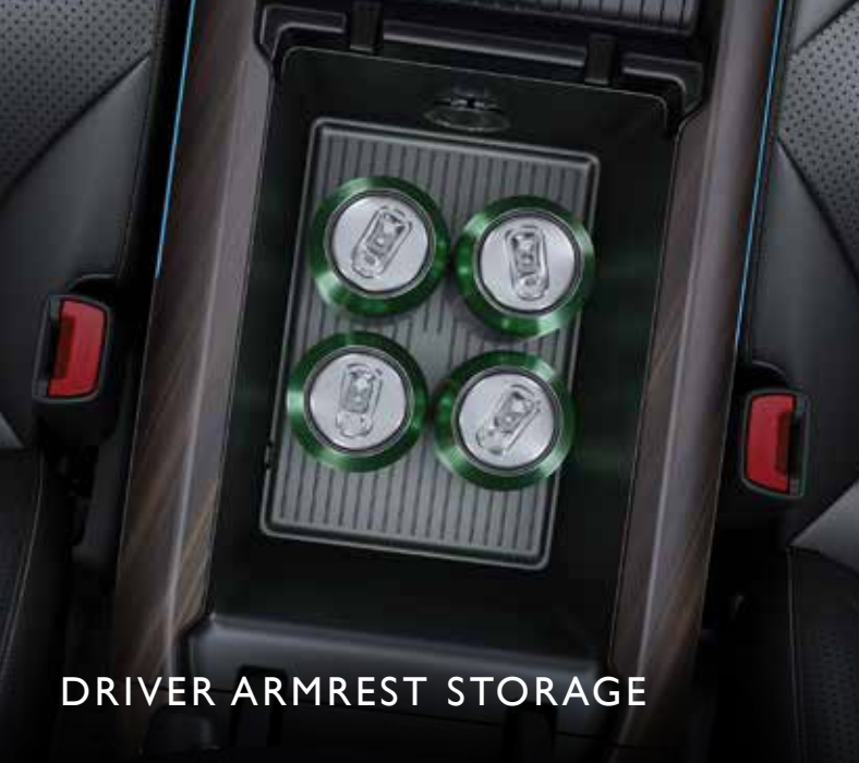
DRIVER ARMREST STORAGE