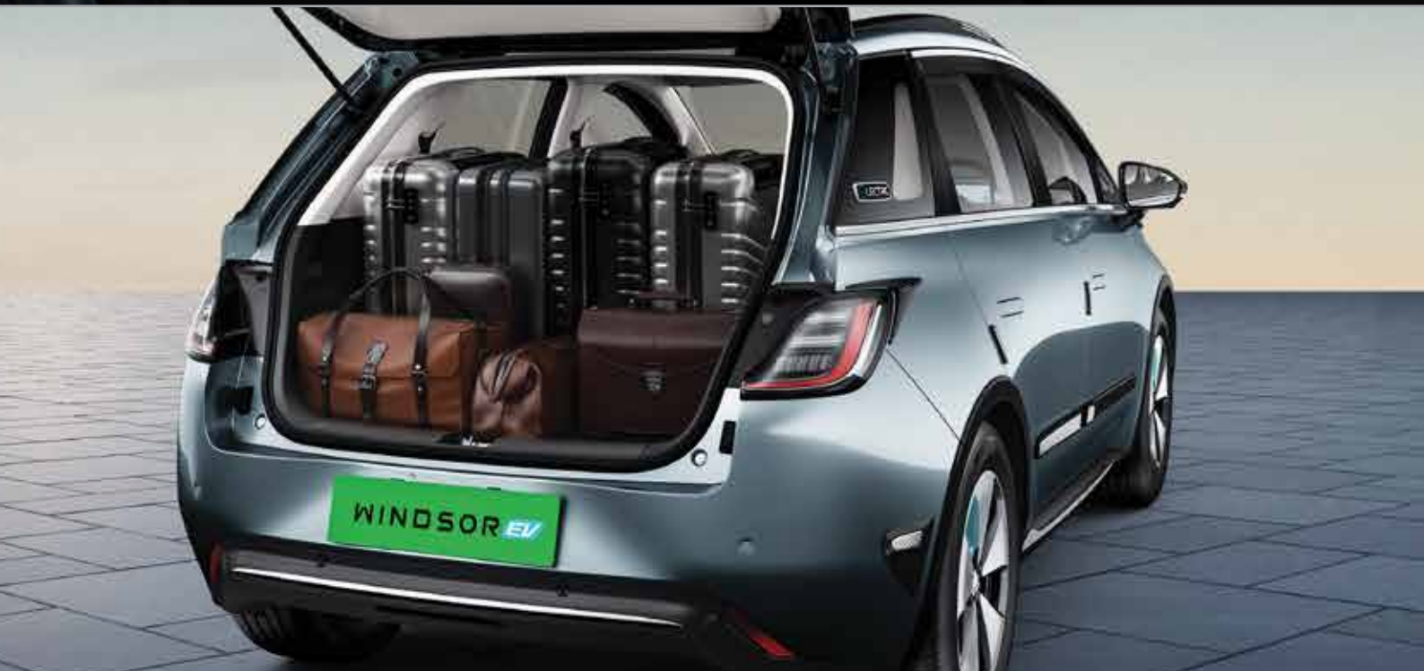
LARGEST-IN-SEGMENT 604* L BOOT SPACE