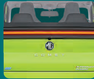
Extended Horizon Front & Rear Connecting Lights