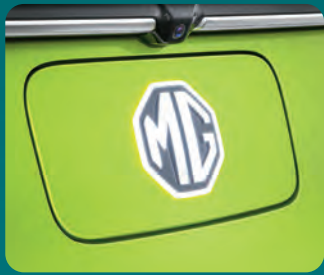
Illuminated MG Logo

Experience the future of driving with the MG Comet EV. Its cutting-edge design, characterized by a sleek 2-door configuration and illuminating entrance, creates a statement wherever you go.